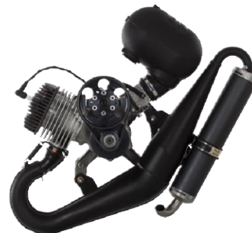
Moster 185 Plus