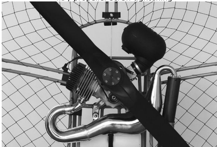
4.1 / propeller screw tightening