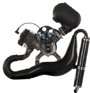
Moster 185 Classic