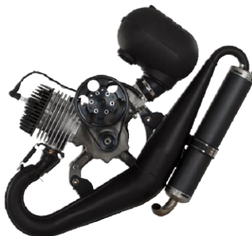
Moster 185 Silent