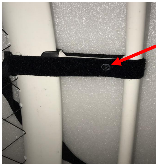
Figure 4 - Rivet highlight on Velcro strap

When you receive the kit, you will need to remove the rivets on the existing Velcro straps, as shown in Figure 4, and then remove the existing Velcro strap.