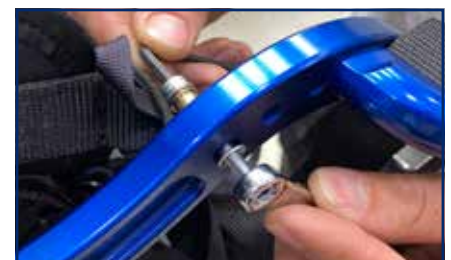
9) Place the 4mm allen key into the nut head and the 8mm spanner over the hex nut.