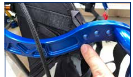
6) Identify the pivot arm that is located on the same side and closest to your throttle cable.