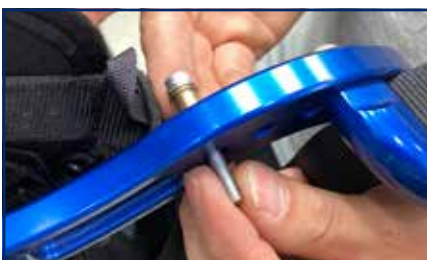
7) Ensuring the bolt head is orientated on the harness side of the pivot arm, thread the bolt into the final rear offset position.