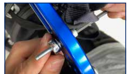
12) Using the allen key and spanner, now loosen the bolt again in an anti-clockwise direction and remove from the pivot arm.