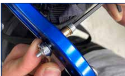
10) Continue to turn the bolt with the allen key using the spanner for resistance to push-fit the brass bush into the pivot arm.