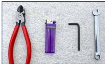
2) To fit the throttle cable retainer you'll need a 4mm allen key, 8mm spanner, a pair of snips and a lighter.