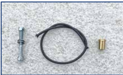
1) The throttle cable retainer kit consists of a bolt, a hex nut, two washers, a brass bush with collar and a length of bungee cord.

Pilots should contact Parajet to request an upgrade kit which will be sent out free of charge. This kit should be fitted to all older Parajet models following the installation instructions detailed below in this bulletin.