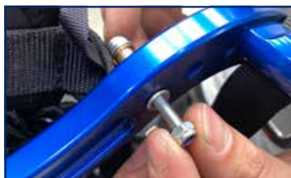
8) Place the washer onto the bolt and begin threading the hex nut onto the bolt by hand. Ensure hex nut is engaged correctly.