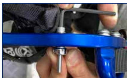
11) Ensure the brass bush is fully located with a nice and tight fit and the collar located flush to the pivot arm.